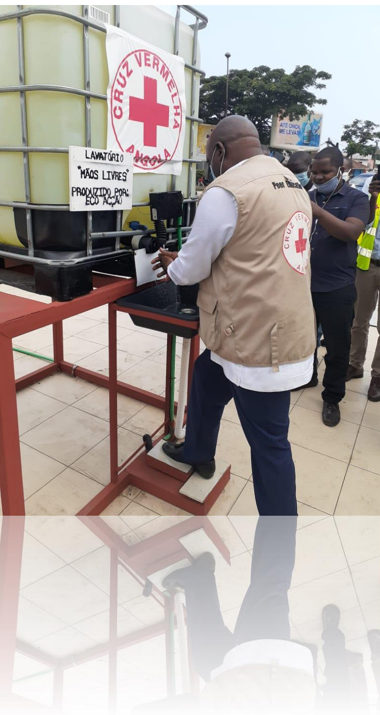
WASHBASIN WITH 4 HYGIENE POINTS ( quadruple )